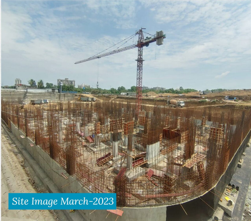
Site Image March-2023

PROJECT UPDATES • CULTURE • PEOPLE • EVENTS • TRENDING • EXPLORE